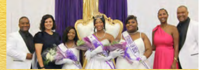
MISS LYDIA SOCIETY AND RUNNERS UP